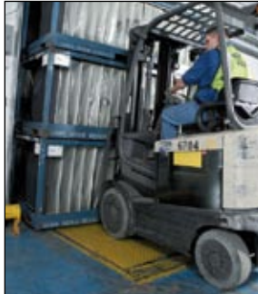
Allows for full width access

The truck is positioned between dual wheel guides as it approaches the loading dock. When the truck is in position, the dock attendant pushes the "Raise" button on the control panel to raise the deck to the appropriate height. When loading and unloading is complete, the dock attendant pushes the "Lower" button on the control panel to lower the deck.