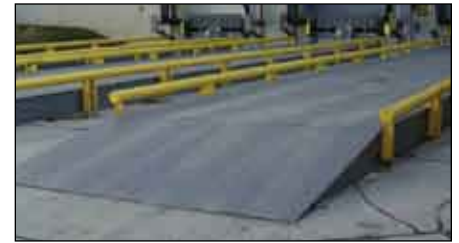
Custom Wheel Riser