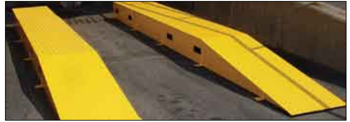
Static Wheel Riser