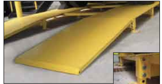
Adjustable Wheel Riser